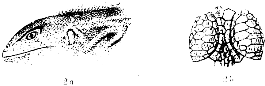
Stenocercus seydi n. sp.